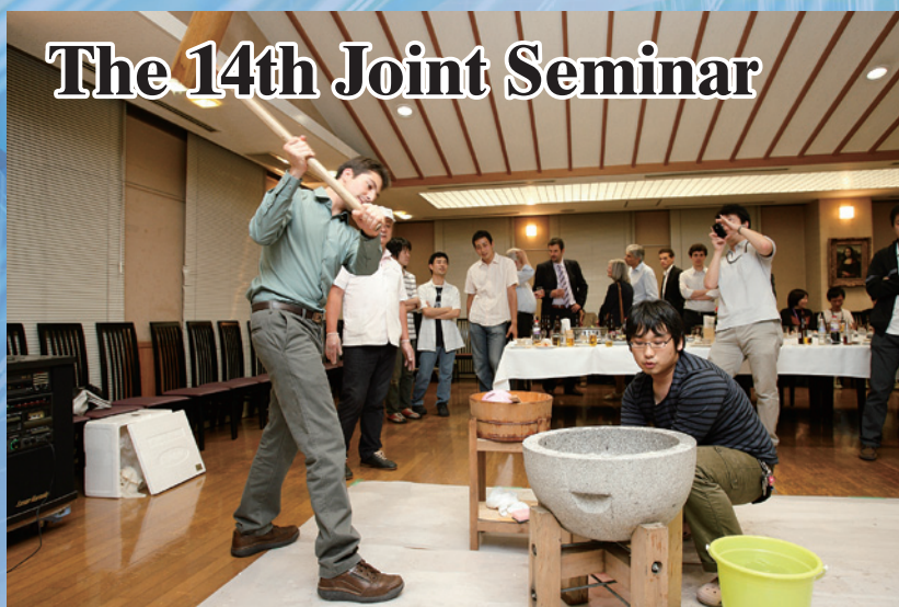
Rice cake making at Reception of the 14 th Joint seminar