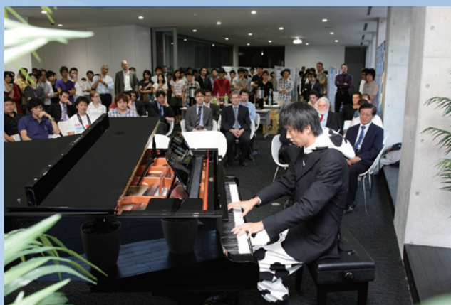
Mini Piano concert with Japanese and German students. The 14 th joint seminar –Muenster-Nagoya– (October 1–2, 2012; Nagoya University)